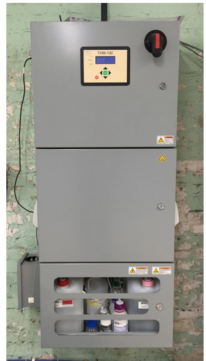
Online THM-100™ Analyzer installed at the Shades Mountain Filter Plant.

SMFP's previous strategy focused on the removal of organics to combat THM formation. However, the required use of chlorine entering the 4 acre open air sedimentation basin to minimize biological growth elevated plant THM levels. The BWWB often conservatively operated their facility while waiting to receive results to ensure they remained in compliance with regulatory requirements. This approach resulted in extensive enhanced coagulation, which increased operational expenses on chemicals, sludge removal, processing, power and other resources.