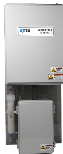
SafeGuard™ Pro real-time water quality analyzer support system.

Water and wastewater service providers bear the responsibility of minimizing these risks and incur hidden lifetime costs resulting from frequent inspections, cleanings, calibrations, and replacements of sensors that are needed.